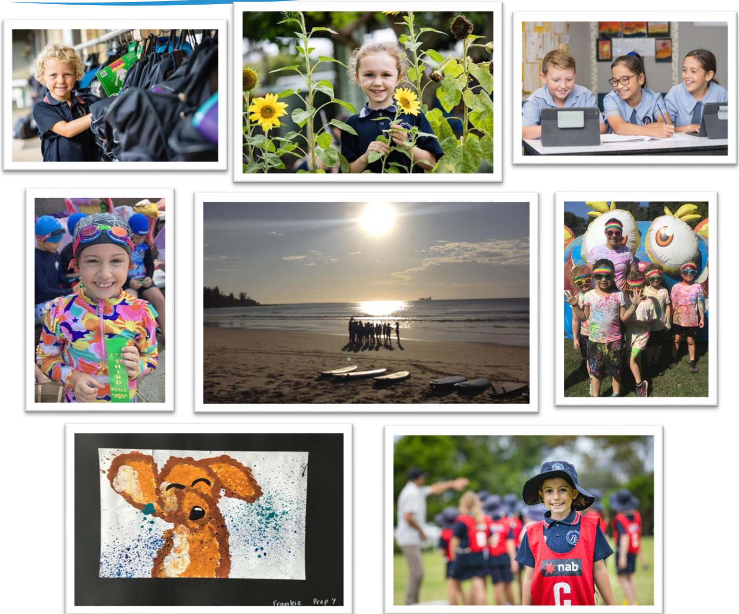
All photos in this Document © BCE, Our Lady of the Rosary School, Caloundra (2023)